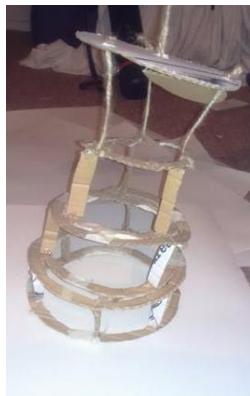
Installation mock up

I think my strength was that I can push troughs the different difficult problem such as the technical problems as well as the emotions problem that has occur during the whole process. The different collaboration has thought me a lot in the sense of concept development and I do not need to keep the idea to one and could be change for the better. However, I think that my communication skills need to be better because I was quite short tempered when things did not go the way that planned has set such as the difficulty in deciding the place for my 'Ampersand' installation placement. I was not patient enough with the curation team as they have done all the build and set up for the show.