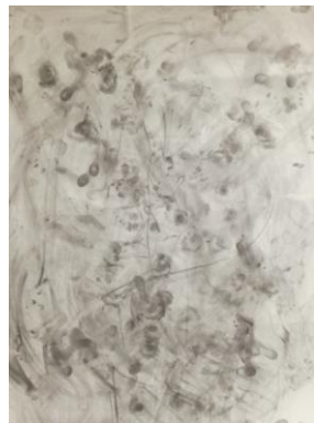
Different marks in dance

Throughout making my work I think they are experimental drawings as they have areas of development and exploration. The journey for this whole project has been a roller coaster ever since the beginning from the project proposal to researching for the project to creating and exploring with different skills and method to establish my project. I think it has been developed greatly from the very surface to educate the audience about dance and it has developed to audiences enjoying my work as a performance piece that was very positively pointed out from my animations in BA3a. I later developed the work to this concept and has gone to large scale mark making. I have understand that my passion for performing is not to educate audiences but to engage them to experience dance either from performance or involve themselves to it. Throughout my performances in the studio there are a few audiences that have stopped and curious about the things that I have been doing.